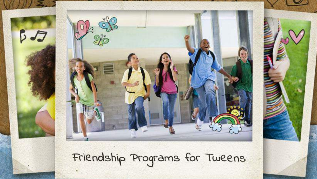
Friendship Programs for Tweens